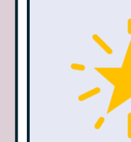
Strands of Practice design created by TP incorporated into Framework