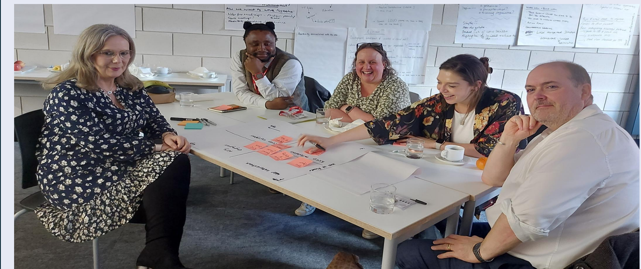
TPs at a workshop to agree Framework design